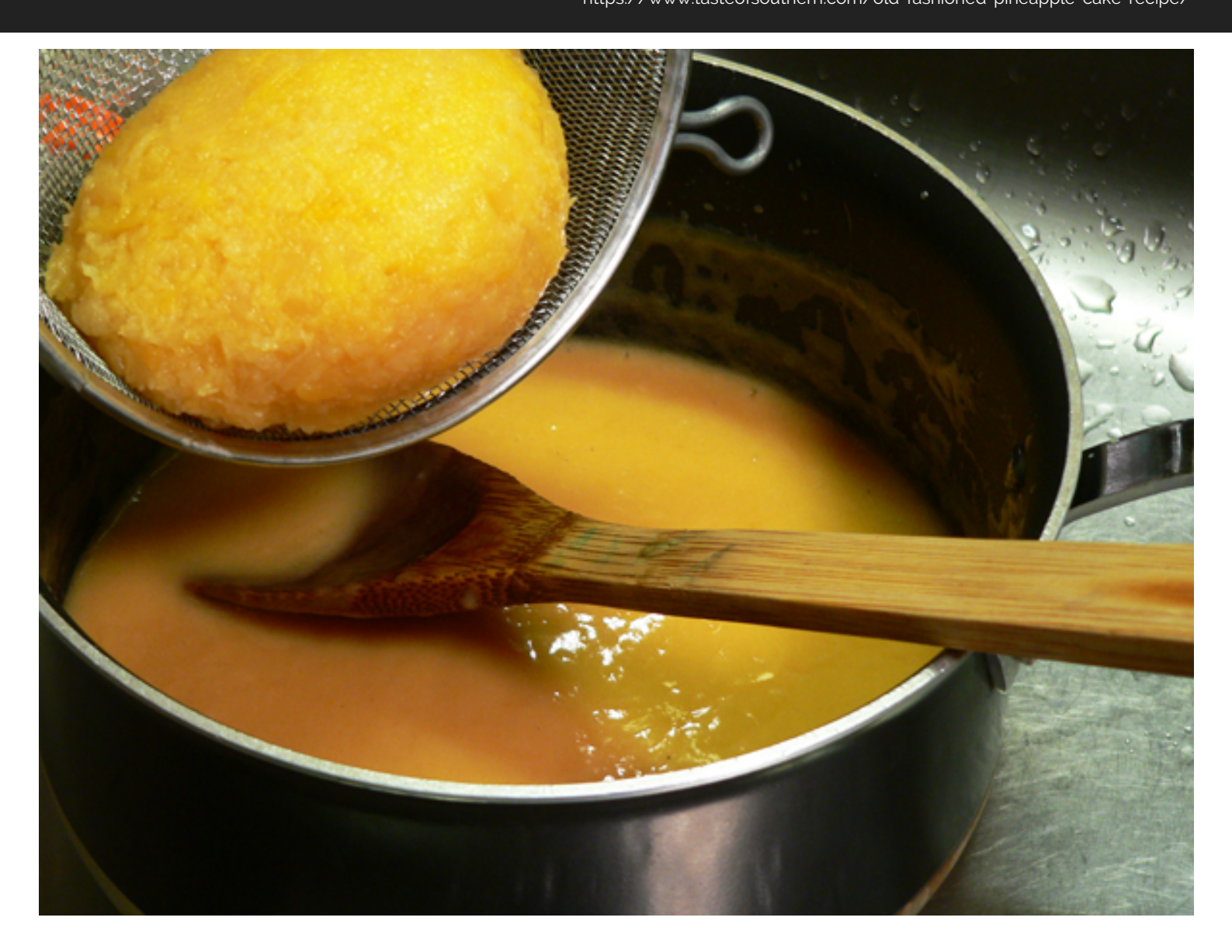
Add the drained pineapple.