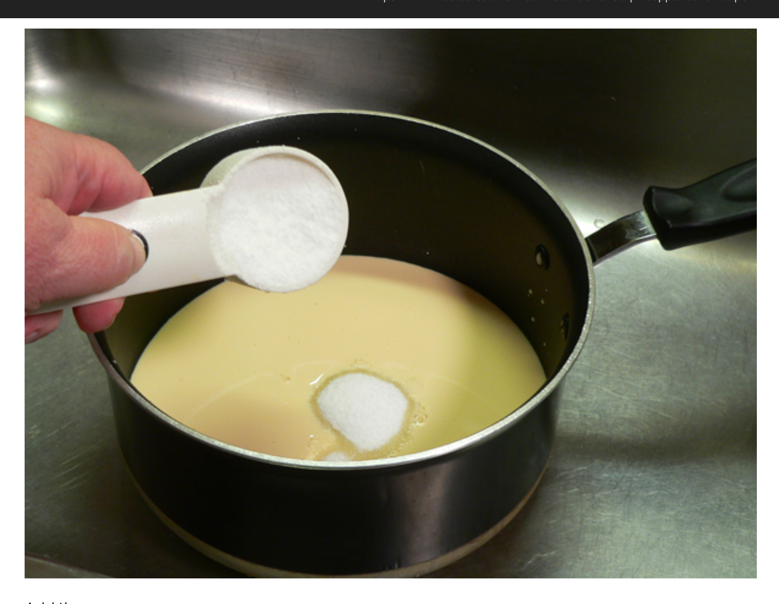
Add the sugar.