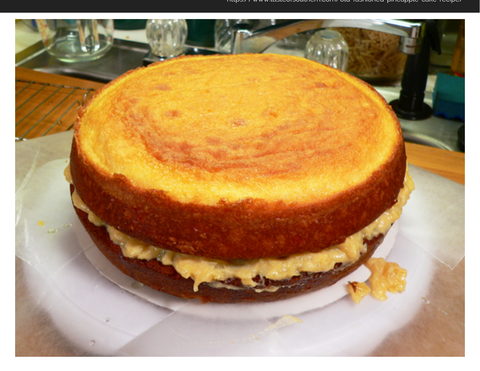
Add the second layer.

Typically, I would have turned this one bottom up also, but it didn't have a big dome from baking that I needed to remove, so I just put it topside up.