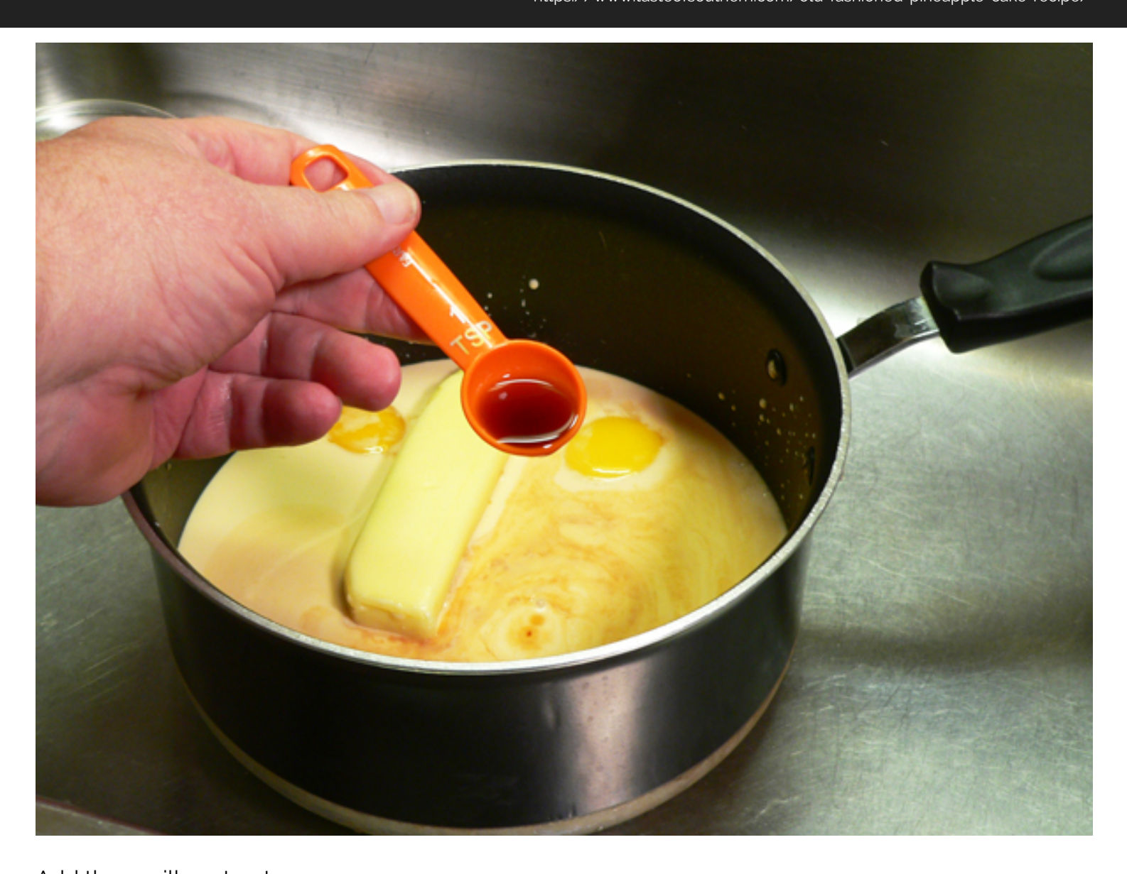
Add the vanilla extract.