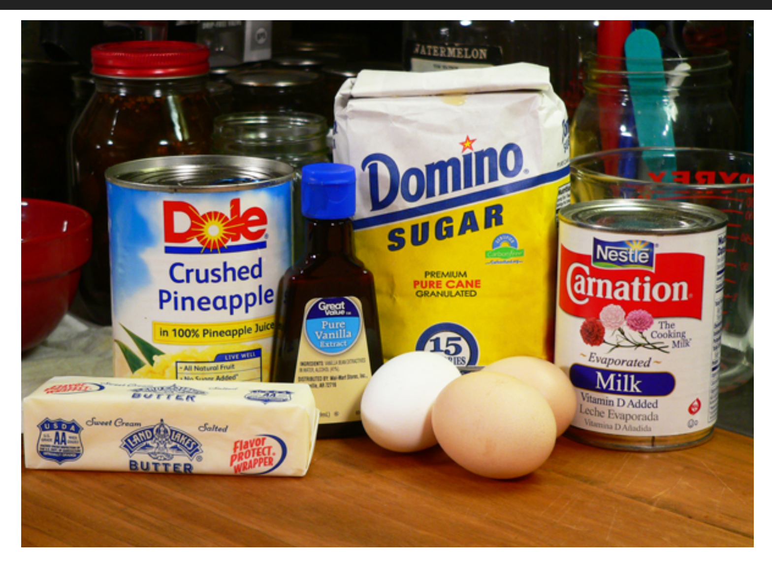
Pineapple Cake Frosting , you'll need these ingredients.