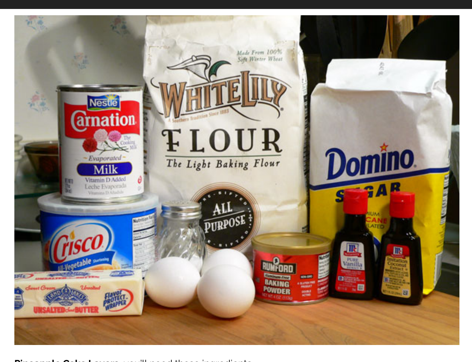
Pineapple Cake Layers, you'll need these ingredients.