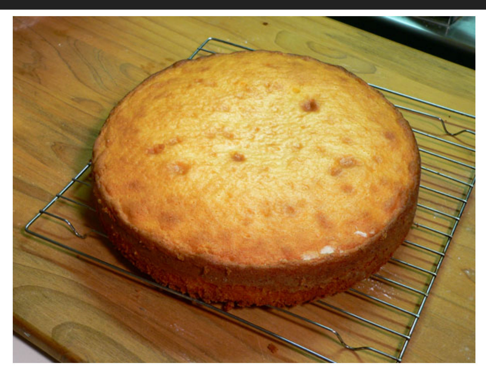
You'll need our Basic Cake Layers for this cake.

I didn't really think it was necessary to repeat the steps to make our cake layers, so I'll just direct you to that recipe here on Taste of Southern.