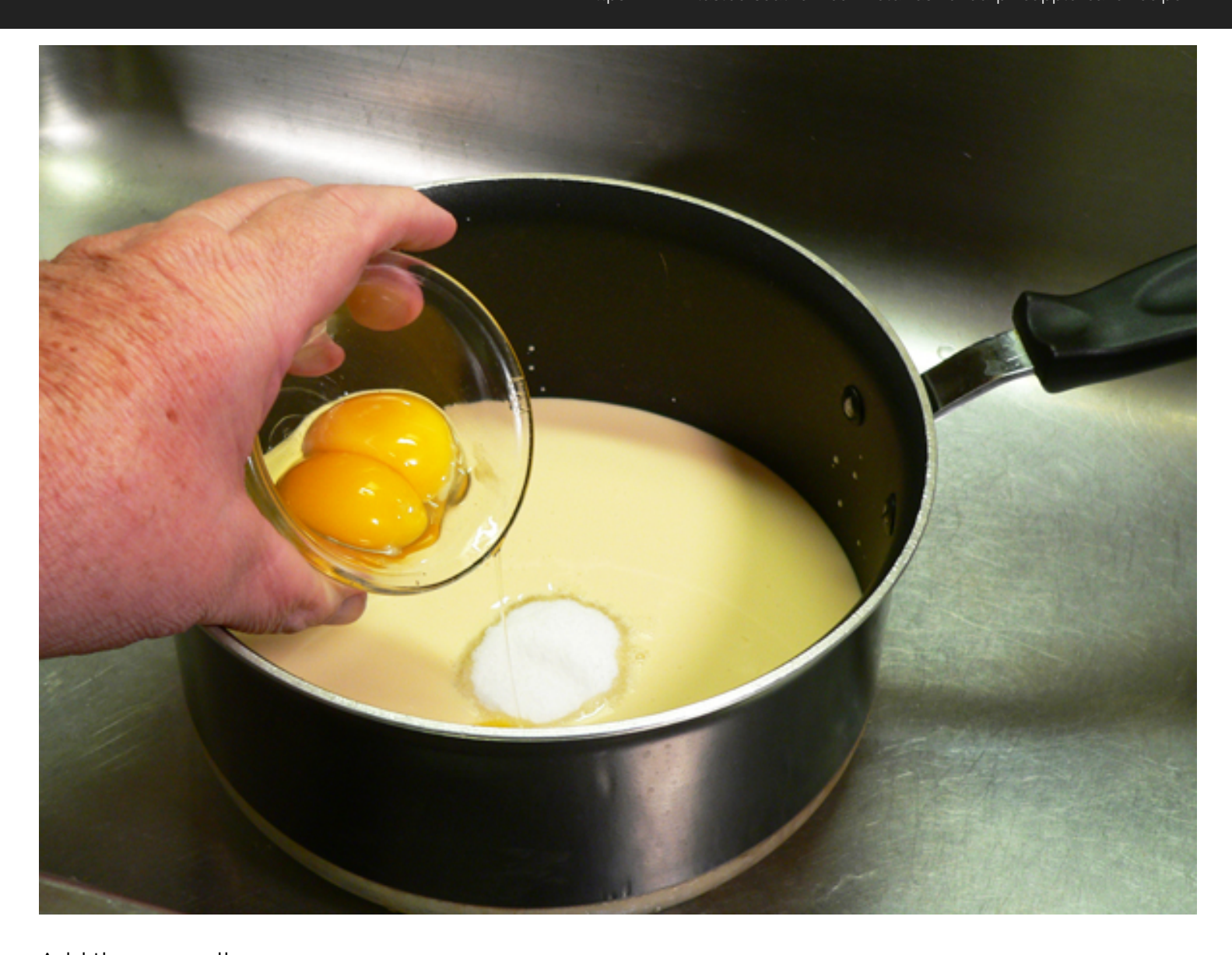
Add the egg yolks.