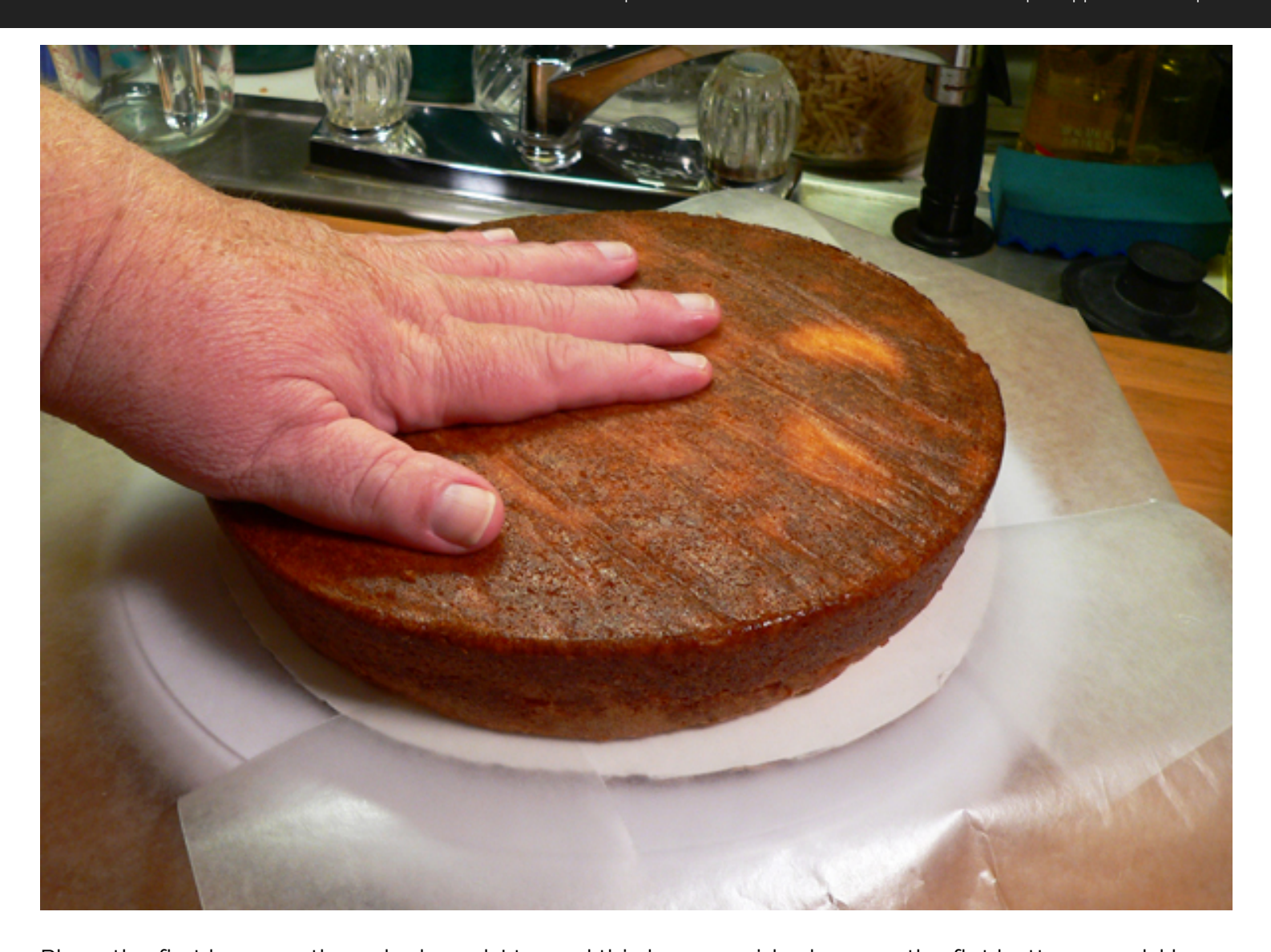
Place the first layer on the cake board. I turned this layer upside down so the flat bottom would be UP.