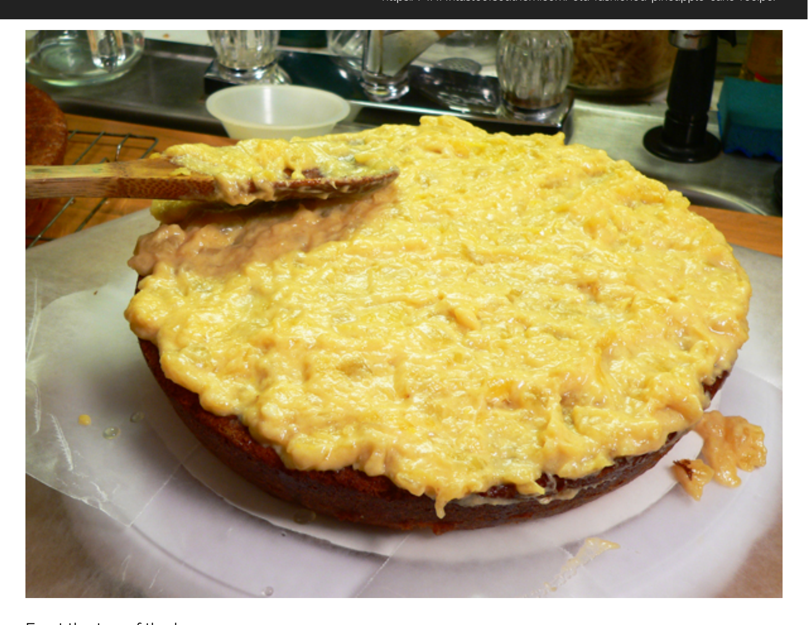
Frost the top of the layer.

I used a little less than one third of the frosting for this part. You'd like to have a good layer of frosting in the middle of the cake, but take it easy so you have enough left to do the top and the sides.