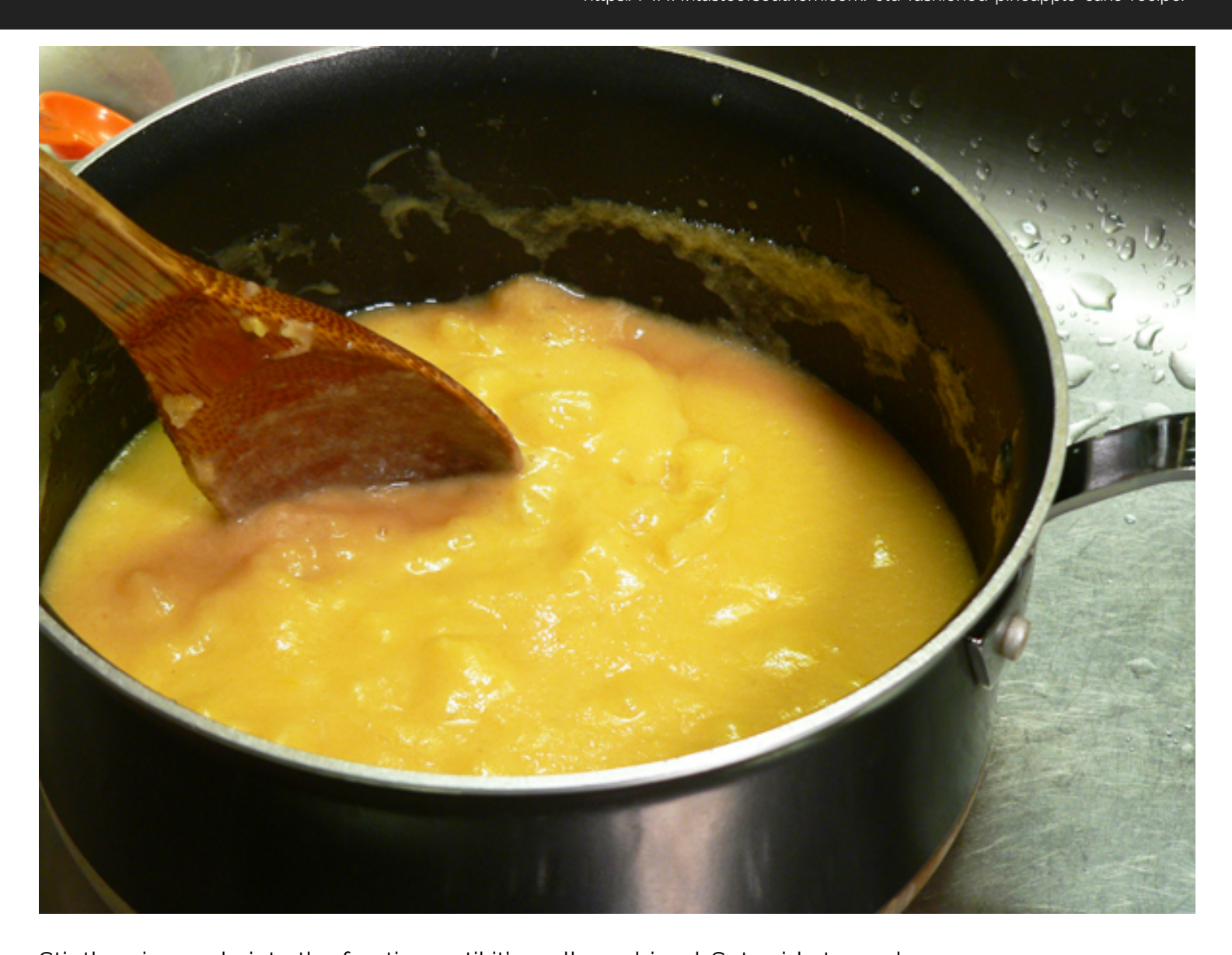
Stir the pineapple into the frosting until it's well combined. Set aside to cool.