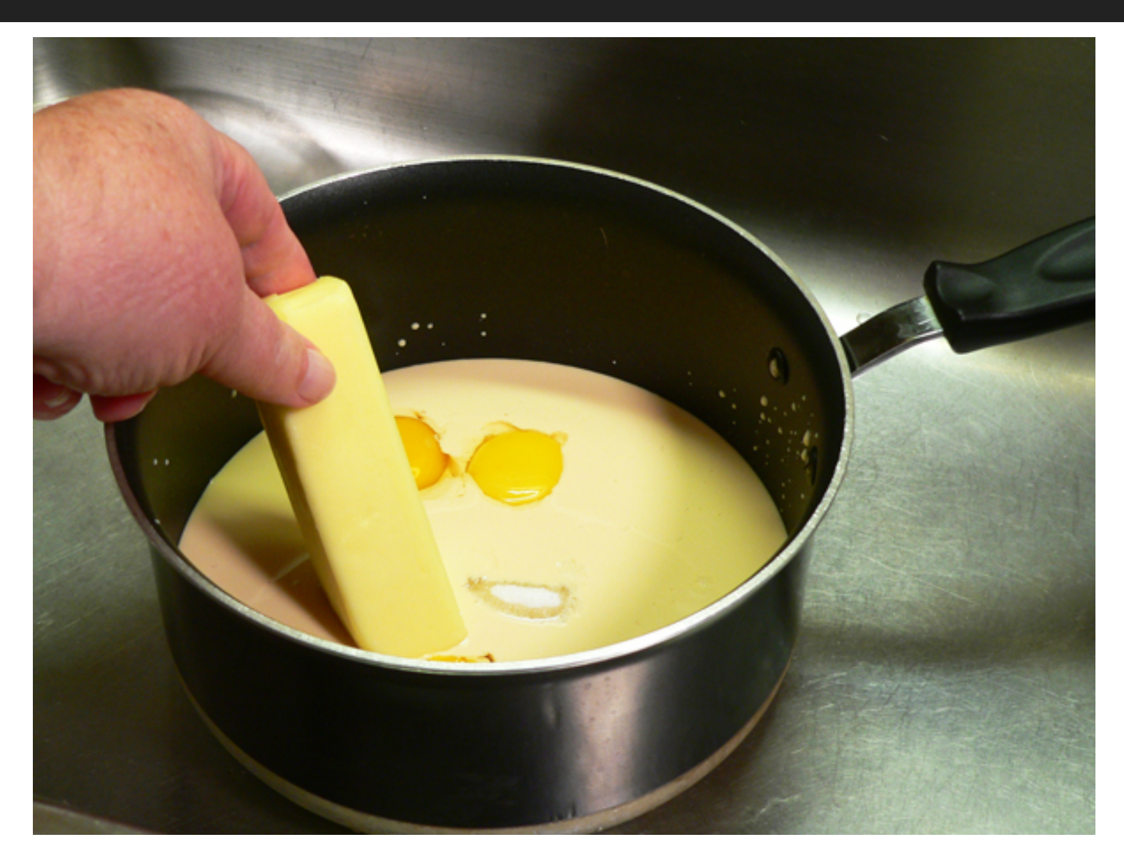
Add the butter.

I just pulled this from the refrigerator and placed it in the pot. It doesn't have to be at room temperature for this particular frosting like most others might call for.