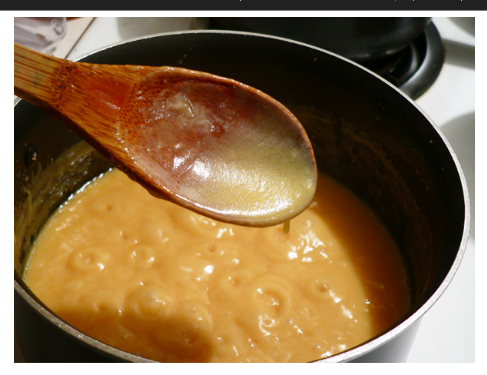
Please follow these steps carefully. It's not difficult, it just needs your undivided attention for a few minutes.