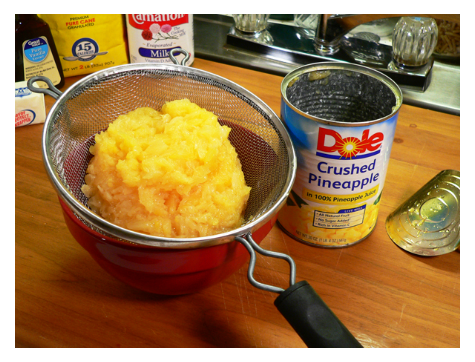
Drain the juice from the Crushed Pineapple. Save the juice for later.

And of course, I always suggest you crack the eggs into a small bowl so if any shell falls in you can easily see and remove it..