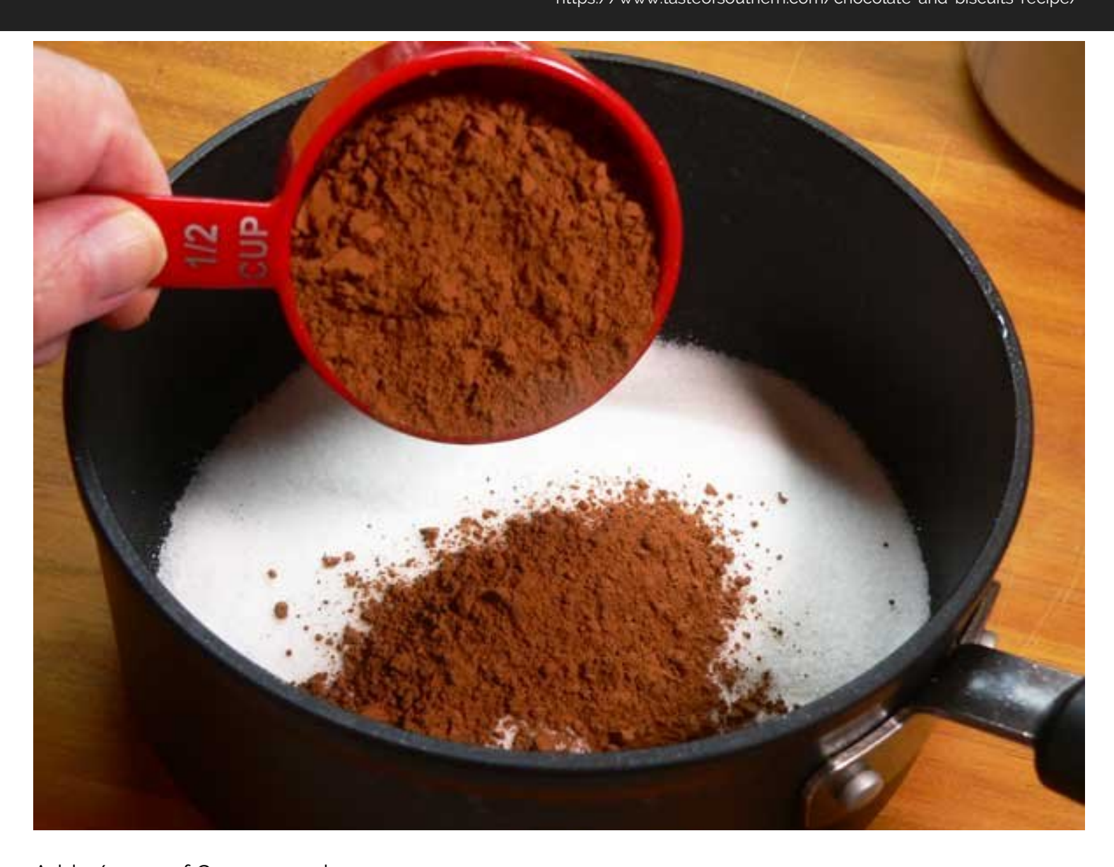
Add 1/2 cup of Cocoa powder.