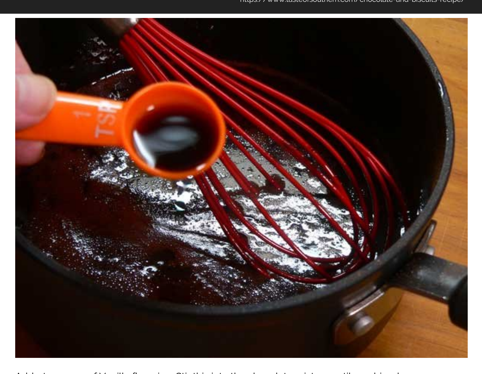
Add 1 teaspoon of Vanilla flavoring. Stir this into the chocolate mixture until combined.