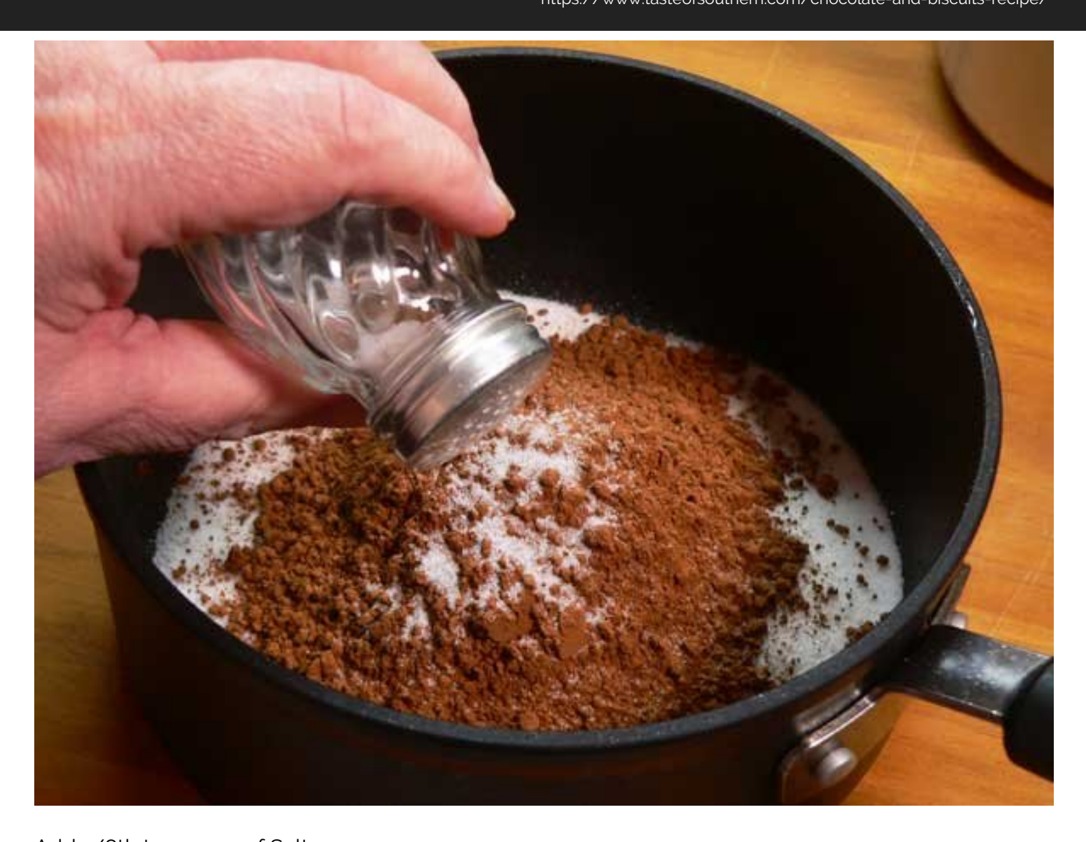
Add 1/8th teaspoon of Salt.