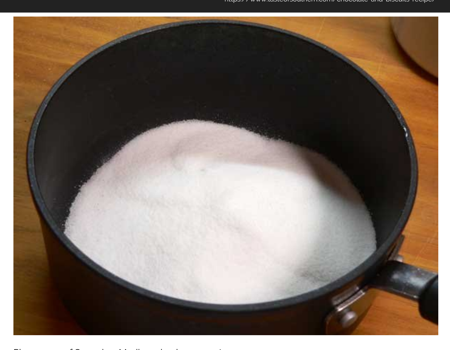
Place 1 cup of Sugar in a Medium sized sauce pot.