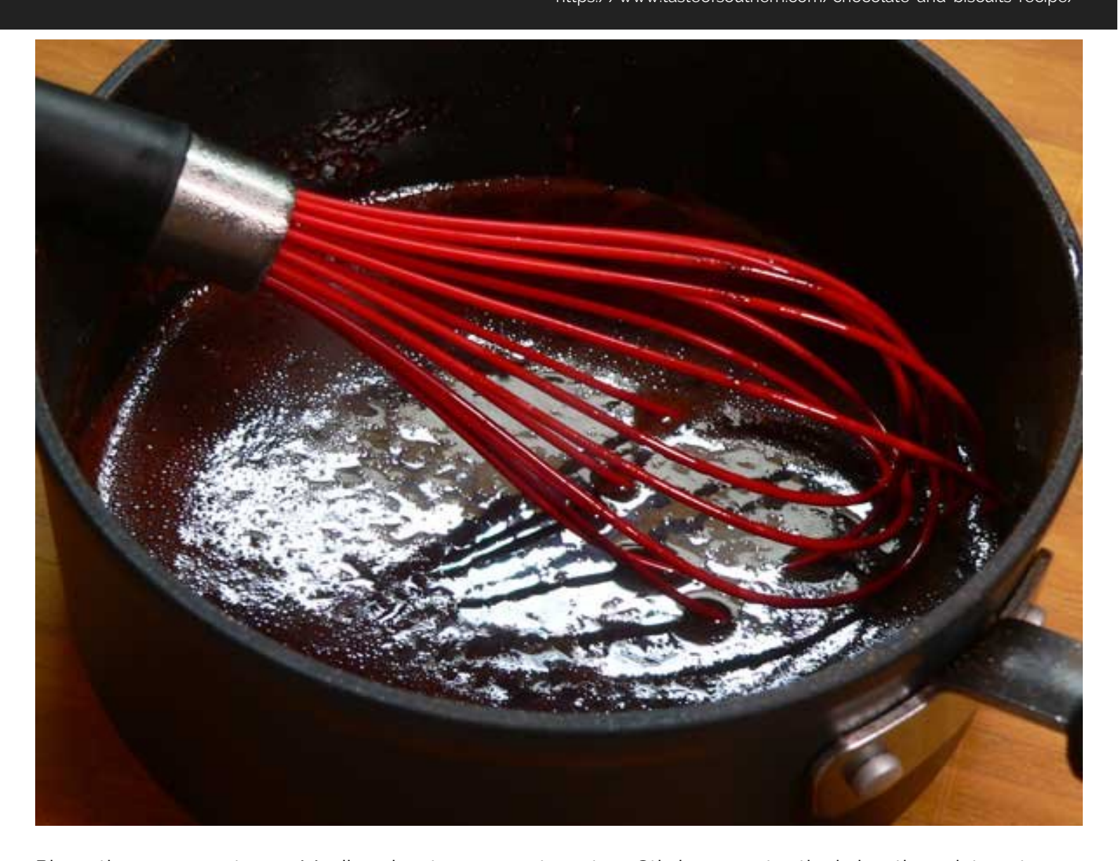
Place the sauce pot over Medium heat on your stove top. Stirring constantly, bring the mixture to a boil. Continue to stir and let simmer for ONE minute. Remove from heat.