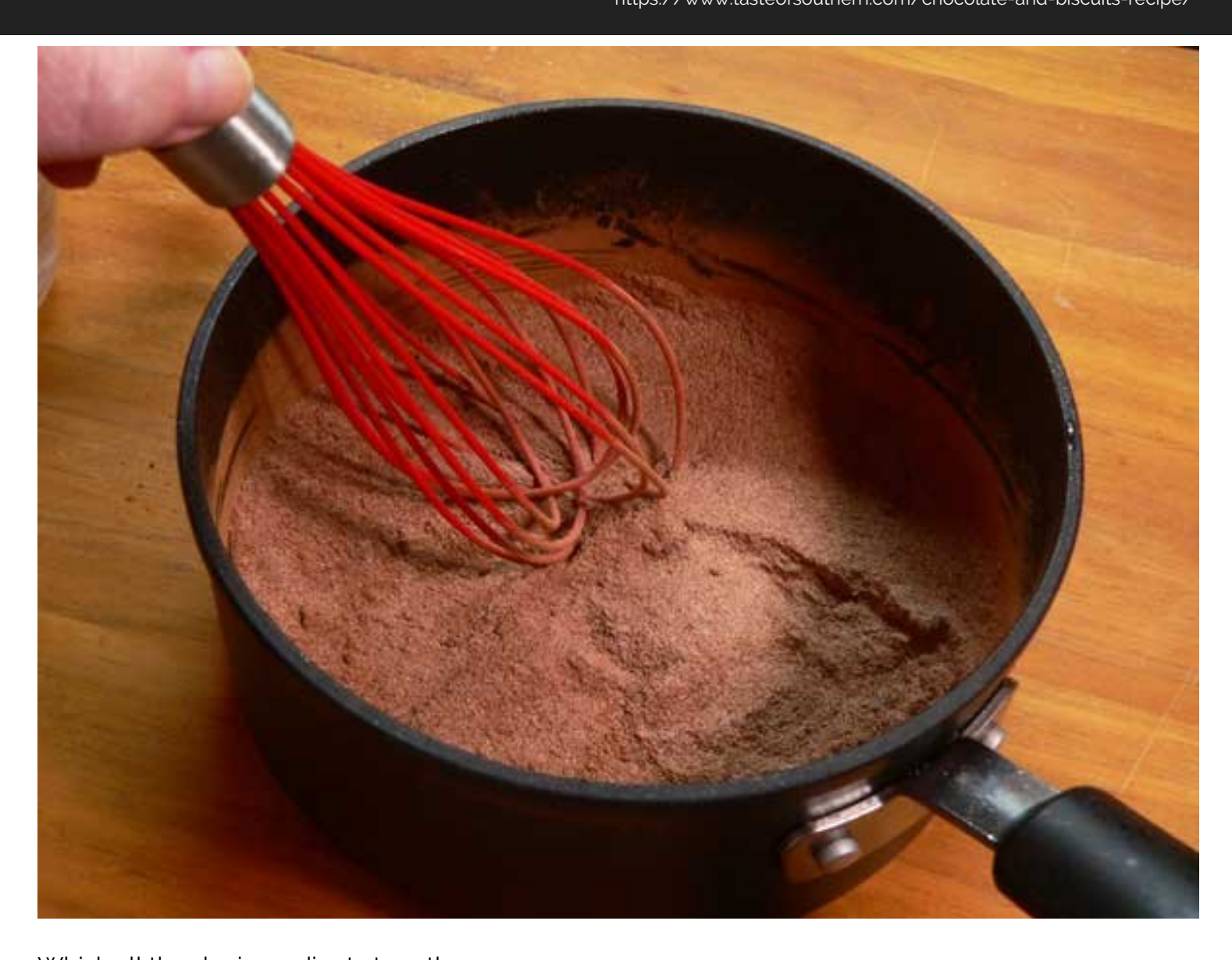
Whisk all the dry ingredients together.