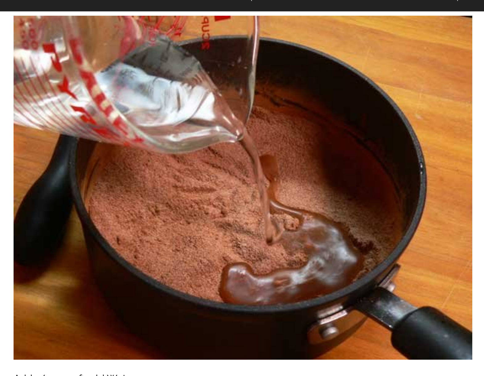
Add 1/2 cup of cold Water.